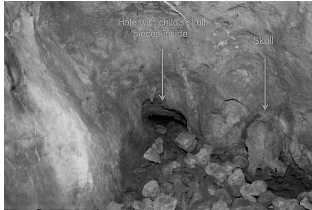
Figure 4: Niche n. 5 where pieces of human skulls and a long bone were found.