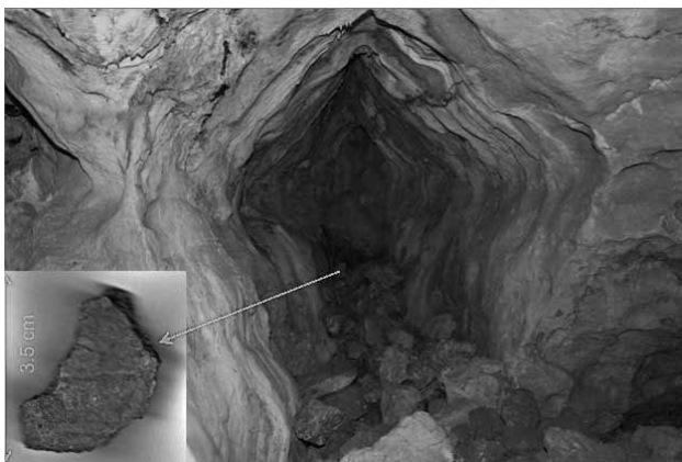
Figure 7: Niche n. 1 showing features resulting from an ancient long-lasting waterfall evoking feminine symbolism. A pit was dug at its base in the floor where two human skulls were deposited beneath the stones.