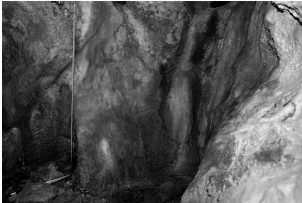
Figure 5: Rock-art painted panel 0.3 m by 0.3 m on the left wall of niche n. 3.