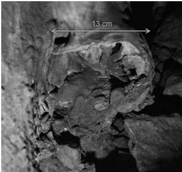
Figure 3: Detail of the human half skull.