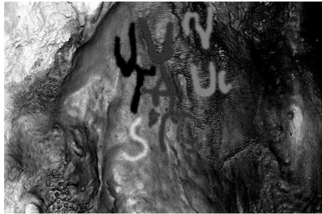
Figure 6: Detail of figure 5. Grey tones and white tonality were added to the photograph to aid interpretation. The anthropomorphic horned-head figure holding a bow aimed towards a horned animal is visible. M. G. Gradoli