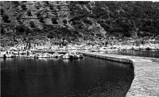
▲ Fig. 3 - Overview of Cachão do Algarve, with delimitation of core rocks identified, (1973). CIART - Centro de Interpretação Arte Rupestre do Vale do Tejo