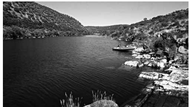
Fig. 1 - View of archeological site of S. Simão. CIART - Centro de Interpretação Arte Rupestre do Vale do Tejo ▼ Fig. 2 - Delimitation of the study area, 8900 ha

2006 Il paesaggio como teatro. Dal territorio vissuto al territorio rappresentato , 5ª Ed. Venezia, Marsilio, p. 237.