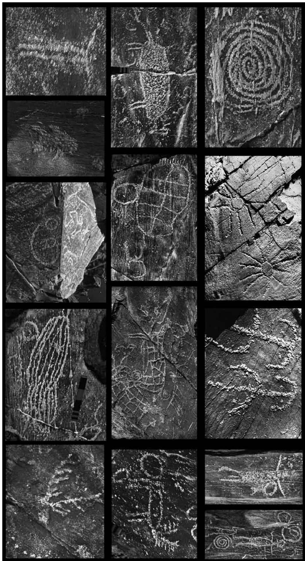
Fig. 6 - Some of the submerged engravings; CI-ART - Centro de Interpretação Arte Rupestre do Vale do Tejo