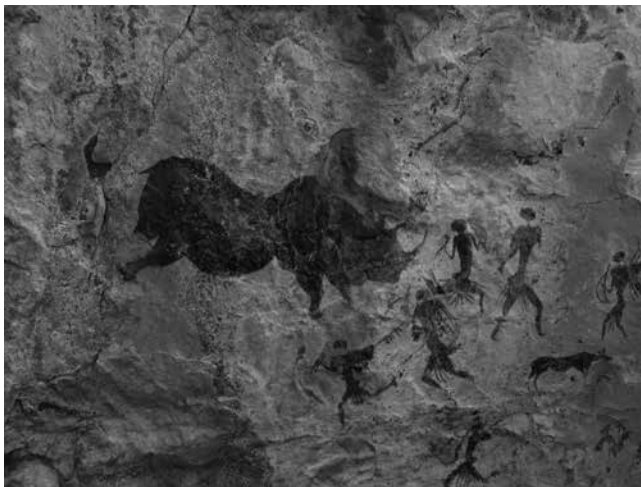
Fig. 4 - Noukloof Mountains, Namibia