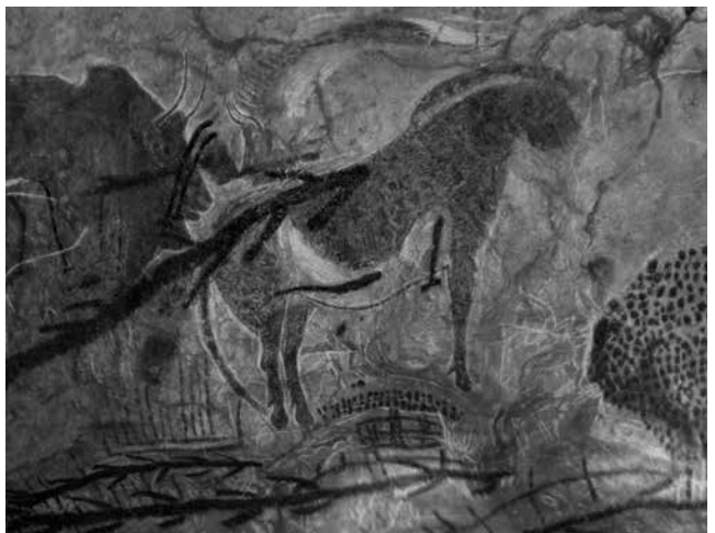
Fig. 6 - "Canonical" horse, Marsoulas (model), Parc de la Préhistoire, Tarascon-sur-Ariège, France.