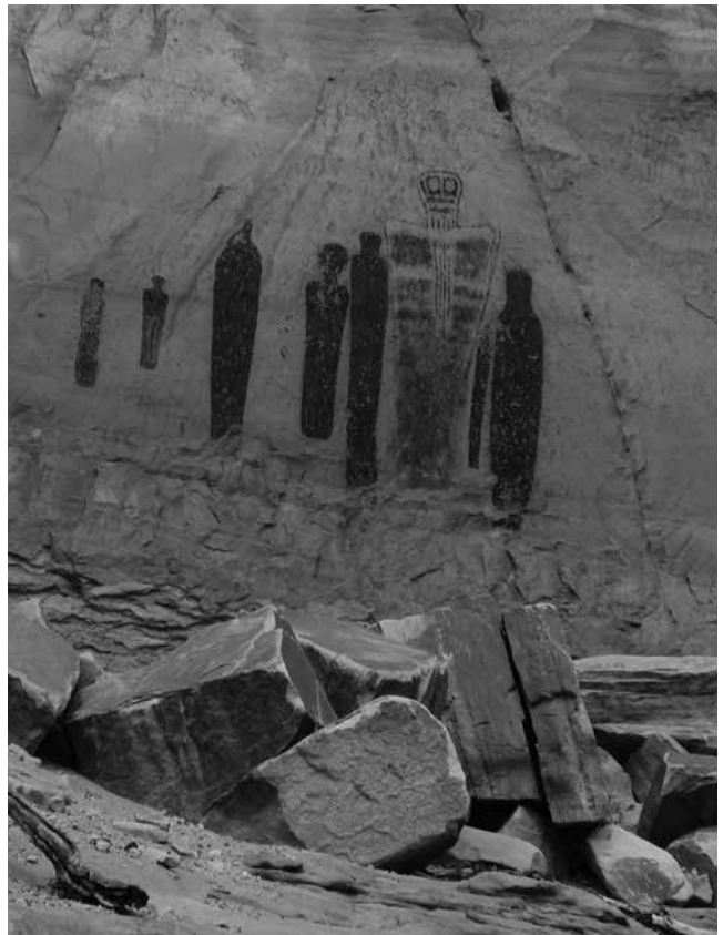
Fig. 3 - Barrier Canyon, Utah, USA