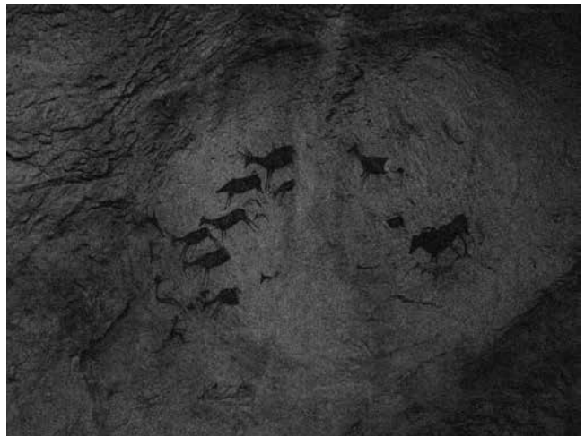
Fig. 5 - Cova dels Cavalls (model), Museu de la Valltorta, Tirig, Spain