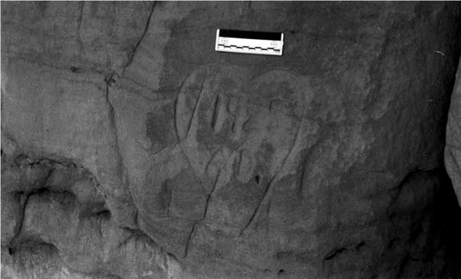
Fig. 3 - Incised heart with initials and date - Stone Quarry Canyon