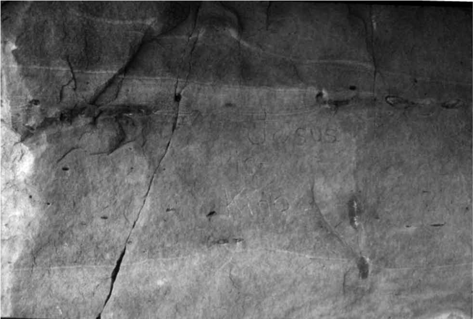
Fig. 2 - "Jesus is King" - Craven Canyon

can be expected to vary with the viewer(s) as well as through time. Moreover, the communication, while active in its visibility, can be altered with intention to revise or influence meaning.