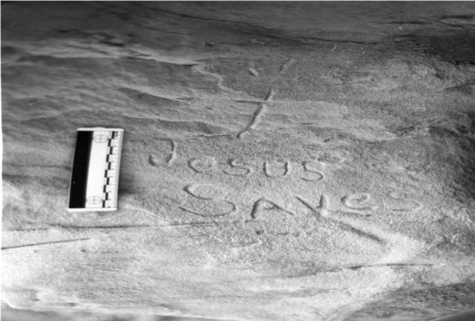
Fig. 1 - "Jesus Saves" - Stone Quarry Canyon

tive American groups have actively contested ownership of this landscape. The Lakota Sioux, Cheyenne, and Arapahoe continue to maintain the resource-rich Black Hills as a sacred landscape within which many places of petroglyphs and pictographs are signified and deemed worthy of protection from damage and desecration, most of which are stylistically dated from the Middle Archaic (5000-2500 BP) throughout the post-contact era. In 1980 the U.S. Supreme Court ruled that the Black Hills were appropriated by the U.S. Government in violation of the 1868 Treaty and a financial settlement was mandated. This overall land claim, however, has yet to be resolved. Within the southern portion of the Black Hills are two drainages, Craven Canyon and Stone Quarry Canyon, managed currently by the U.S. Forest Service. The area encompassing these canyons is open to cattle grazing, hunting, and Native American traditional activities. During the 1950's and 1970's uranium exploration and mining in this area was conducted under permit from the U.S. Government (SUNDSTROM 2003, 2004).