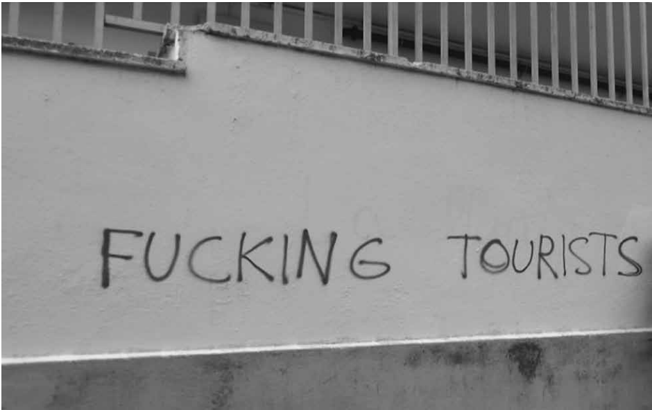
Fig 12 - "Fucking Tourist" - along walking trail leading to Park Guell, Barcelona, Spain.