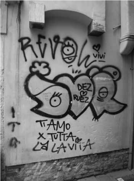
Fig. 10 - Tagging or throw-ups in a busy shopping area of Venice, Italy