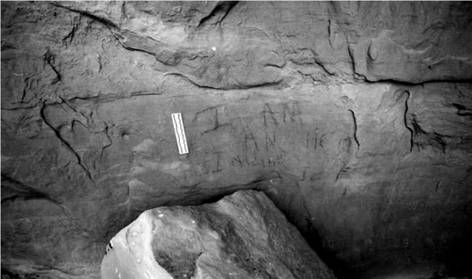
Fig. 7 - "I Am An Indian" - Stone Quarry Canyon

between females, especially those in their post-pubertal years. The "Henrick is a whore" inscription (Fig. 4) reveals, for example, an unambiguous, active, competitive social environment.