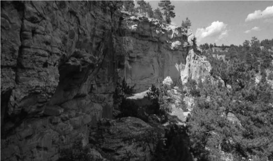
Fig. 8 - Context of painted "white man go home" - Craven Canyon

Hills soon after gold was discovered in 1874, Native Americans, especially the Lakota Sioux, Cheyenne, and Arapahoe, have actively contested rights to ownership of much of the region. Of interest here is the extent to which these broad conflicting claims of ownership and land-use are represented in markings in this landscape, for example, "I am an Indian" (Fig. 7).