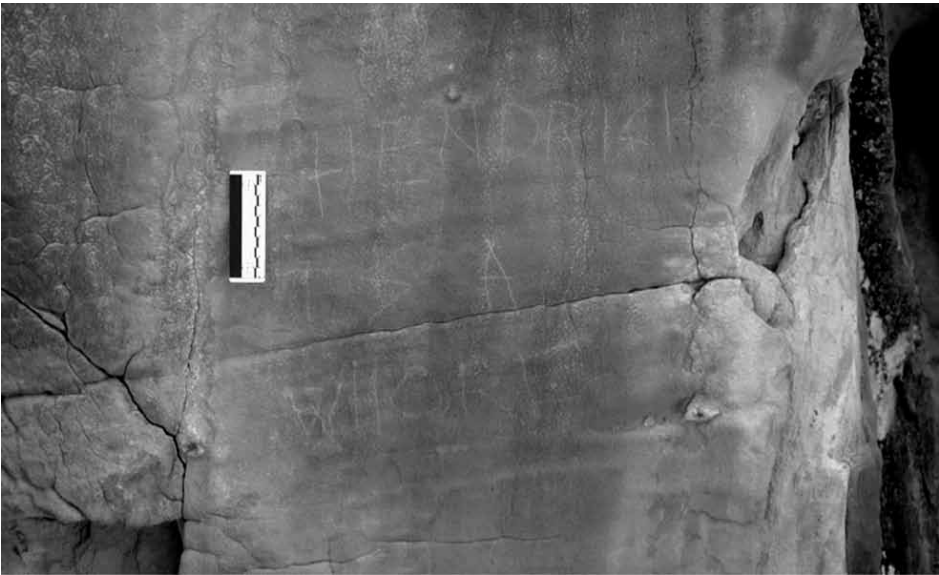
Fig. 4 - "HENDRICK IS A WHORE" - Stone Quarry Canyon

permeated with small rock-shelters and overhangs. An informant highly familiar with this area notes that this canyon has been a setting for the activities of local young people for decades. In this canyon the creator of a marking can signal not only a commitment of intent directed to a selected or potential mate but also signal to active and potential competitors their intent and/or commitment. In a place where a male "John", for example, might carve, within the outline of a he-