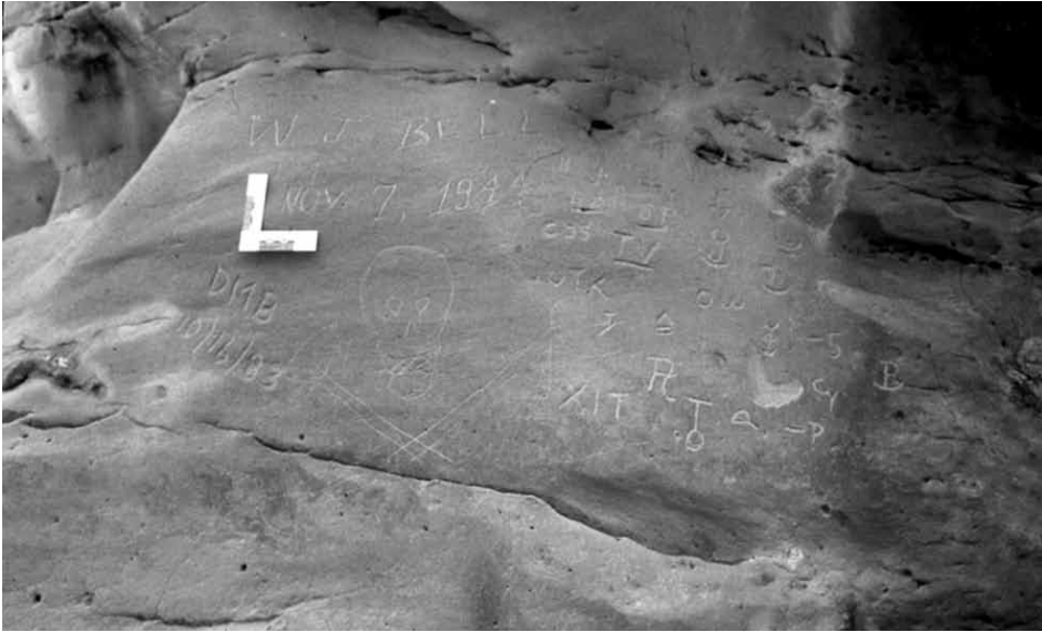
Fig. 5 - Brands, initials and dates – Stone Quarry Canyon