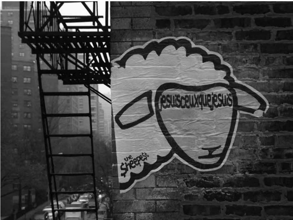
Fig. 11 - "The Sheepst" - New York City