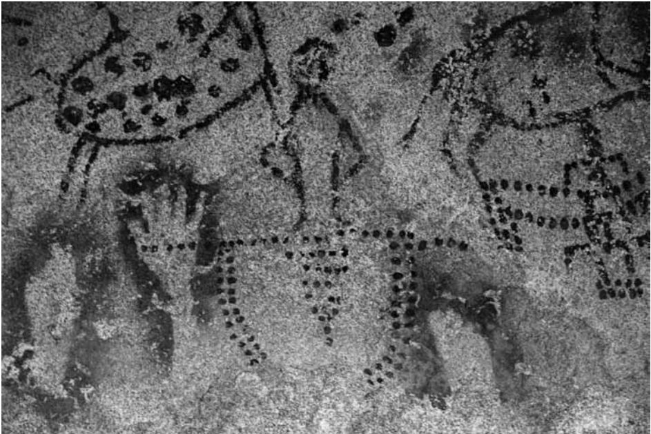
Fig. 4, 5 - Handprints Altai Mountain, Northwest of China