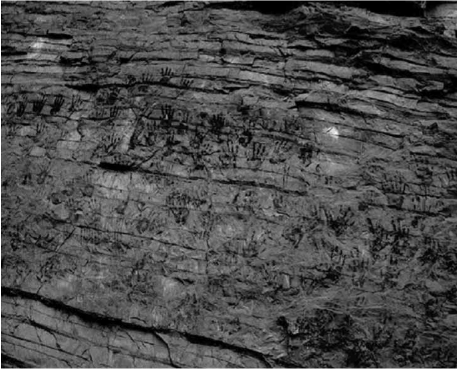
Fig. 6 – Hand Stencils in Tianziyan, Central China

not be neglected to analyze the relationship between the site of hand stencil and its natural setting: inside cave or rock shelter or on cliff, additionally some hand stencils apparently present on the surface of huge stone. Moreover, another dominant index should be considered whether there is the presence of any other archaeological contexts in the vicinity of the site of hand stencils.