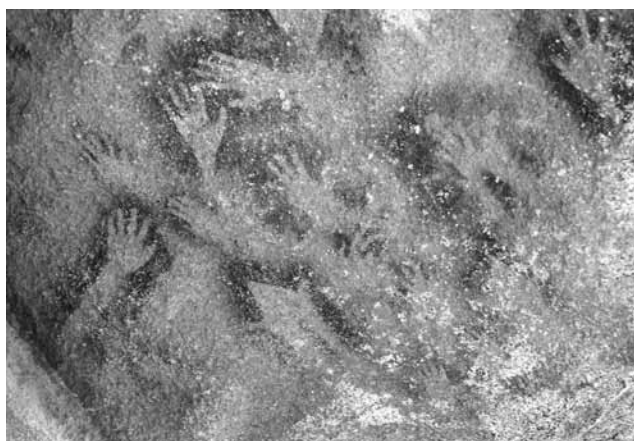
Figgs. 2,3 - Handprint Abulai Mountain, Inner Mongolia China