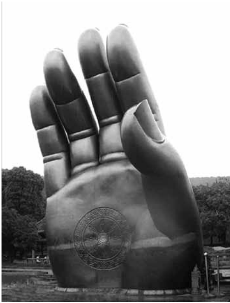
Fig. 9 – Contemporary Statue of Buddhist Hand

already demonstrated the fact that the most splendid masterpiece of the development of human's society is the result of a variety of complicated social institutions as well as relationship networks which are constantly being knitted and improved in order to get them entangled tightly, turning out to be a sort of animal which is free from any arbitrary activities inside the hierarchy and networks, even so, man is always enjoying such similar constructions. Nonetheless, it is the groupment of humankind from which the sociality of human being is derived that has made man become a sort of animal which evolves most rapidly in the world and has got man endowed with gigantic energy on the whole. Since earlier, man appears to have had a clear understanding the significance of the groupment of humankind, which has strongly been evidenced in hand stencils. By far, it has