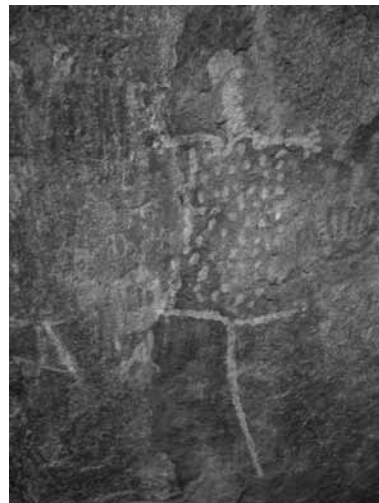
Figure 4. Spread-eagled design delineated in white and covered with white dots. Spread-eagled approx. height 55cm.