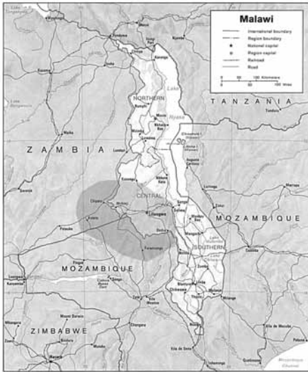
Figure 1. Map showing the location of the rock art of Chinamwali. Map courtesy of the University of Texas Libraries, The University of Texas at Austin (I added the shaded area to show the broad location of the paintings).