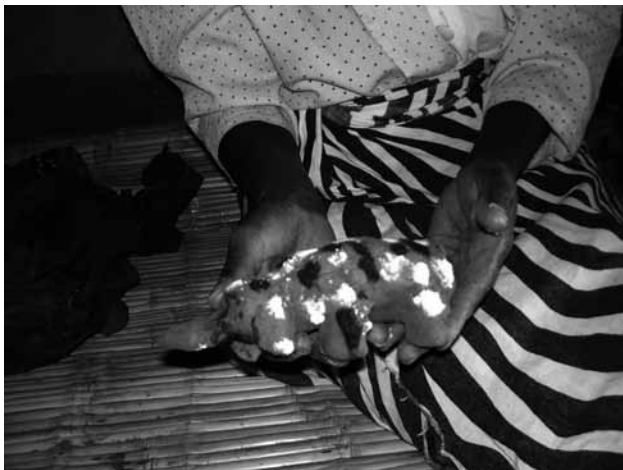
Figure 9. Cheŵa women still make objects for girls' initiation. This chilengo is made with raw clay and covered with red, black and white dots. Recorded in Chadiza district, eastern Zambia (Zubieta 2009b).