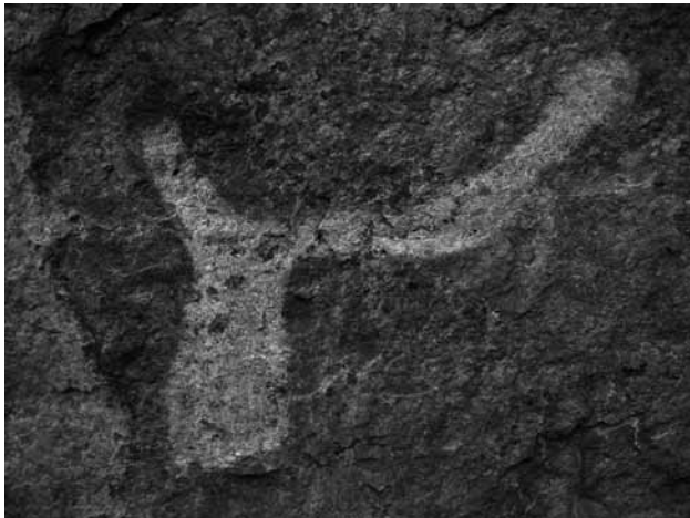
Figure 7. The hoe (approx. 15cm in length) is one of the few artefacts depicted in the rock art of Chinamwali.