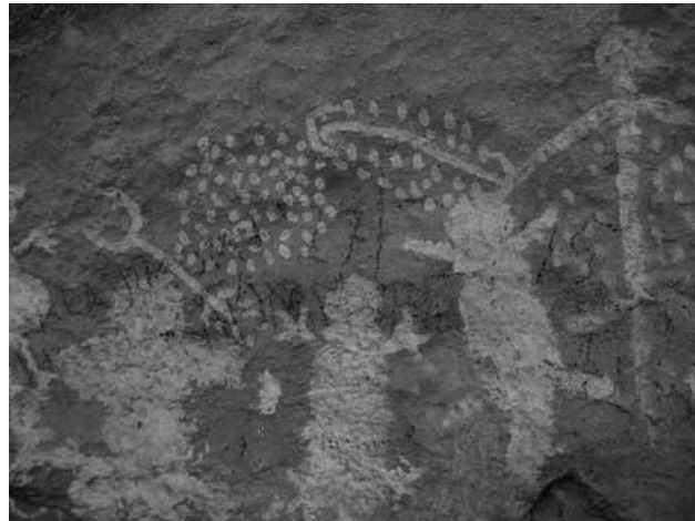
Figure 2. The spread-eagled design is the characteristic motif of the rock art of Chinamwali. In this photography we can appreciate a few shapes of the spread-eagled design. Panel approx. length 50 cm.