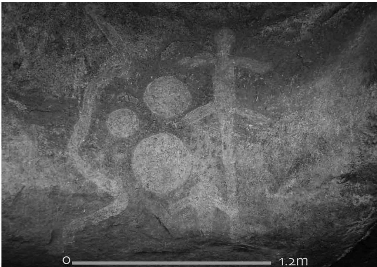
Figure 6. White circles accompany two spread-eagled designs – one with black dots – and a snake-like motif.