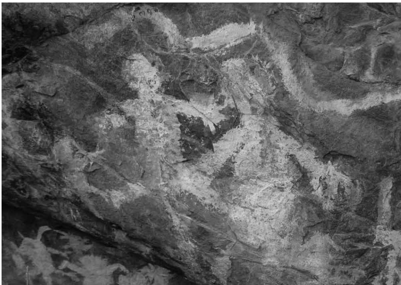
Figure 5. A snake-like motif, originally covered with black dots, accompanies a couple of white spread-eagled designs. The one on the left is partially covered with black dots. Panel approx. length 3m.