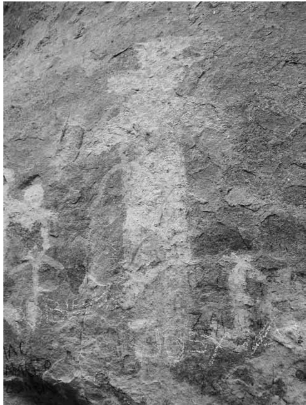
Figure 8. This image was identified as the representation of a baboon at the site Mwana wa Chentcherere II, central Malawi in 2003 by one of the teachers of initiation. Spread-eagled approx. height 50cm (Zubieta 2006: 95-97).