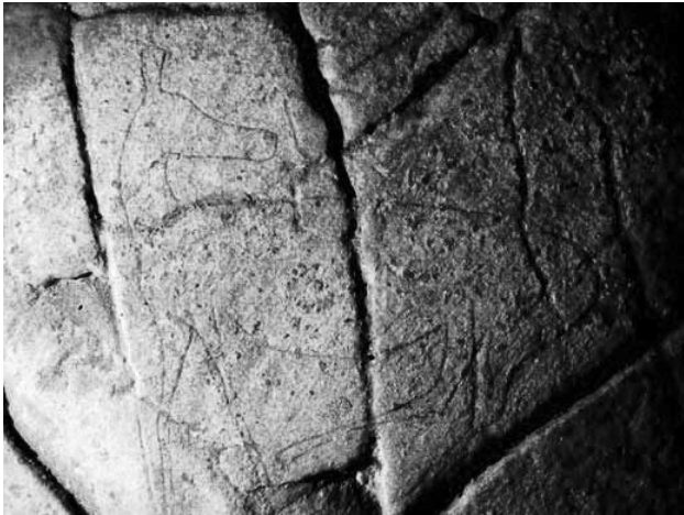
Fig. 3 - Cala dei Genovesi Cave. About 30 Palaeolithic engravings have been recorded, almost all in naturalistic style, animals of small dimensions (from 15 to 30 cm). Between the zoomorphic figures there are cervideus.