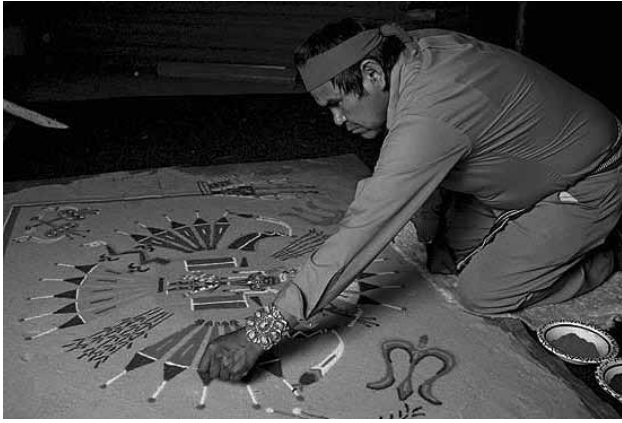
Fig. 1 – Rituals of today. Navajo sand paintings, similar to Tibetan sand mandalas, are created on the floor of the hogan under the direction of the shaman. Before the sun sets, the sand painting is erased and swept onto a blanket to be carried outside.