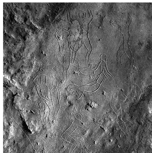
Fig. 6 – Addaura Cave. On the slopes of Mount Pellegrino, near Palermo, in Sicily, the cave has revealed a “unicum” in Pleistocene art: scenes where concentrated in the middle human figures prevail, surrounded by marginal figures of animals.