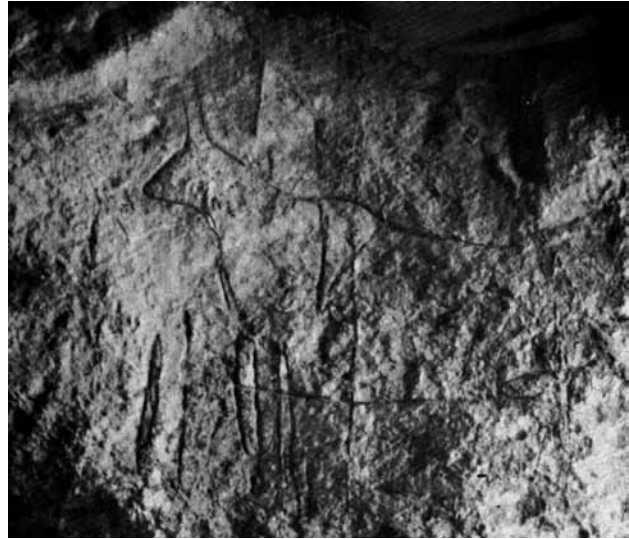
Fig. 2 - Romanelli Cave. The Romanelli Cave in the Puglia region presents a series of carved figures on the walls and on the ceiling of the cavern. One can see a bovideous semi-naturalistic, synthetically outlined, and other schematic – geometric figure similar to the stylized silhouettes of women and vulva.