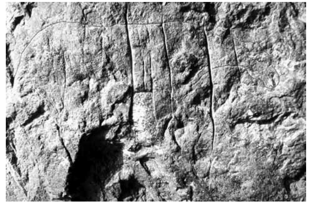
Fig. 8 - Caviglione Cave. An outstanding carved figure of a horse in naturalistic style, outlined in lateral perspective, associated with linear strokes deeply carved by the "polissoir" technique.