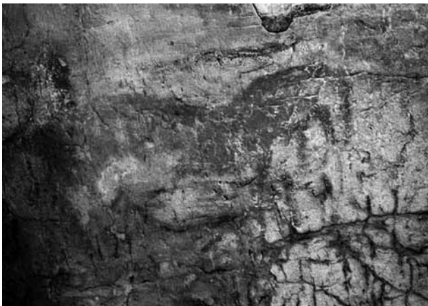
Fig. 5 - Paglicci Cave. The Paglicci Cave has paintings, located in the deepest and darkest part of the cavern, in a sort of niche. Two vertical figures of horses in red ochre.