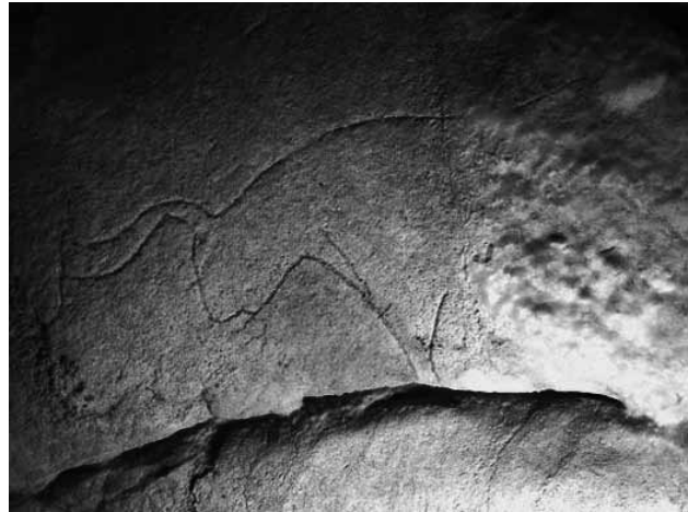
Fig. 4 - Cala dei Genovesi Cave. A carved figure of bovideus.