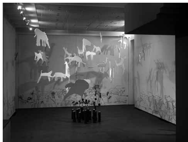
Fig. 12 – Pascale Marthine Tayou, “Animosités”, temporary exhibition 2009.