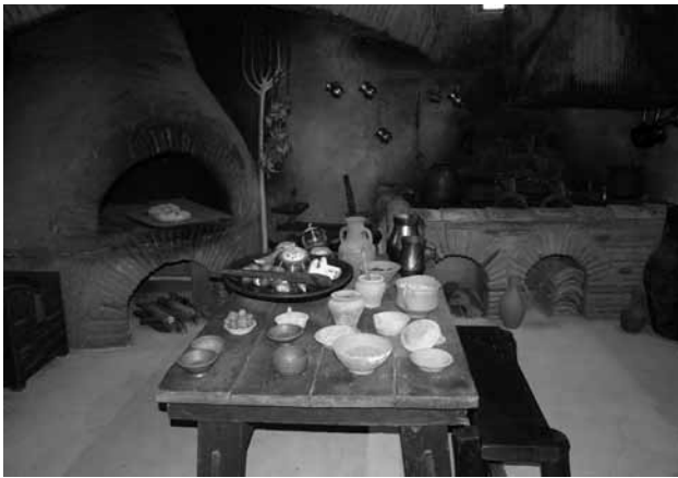
Fig. 3 – The Domus Romana Museum, in Juliobriga, Cantabria.