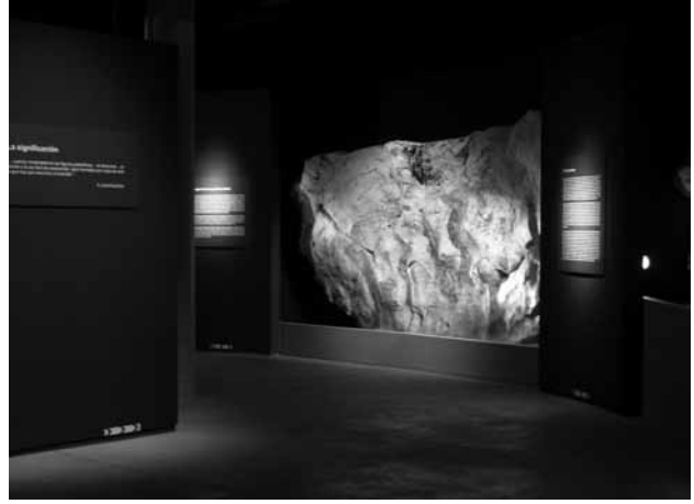
Fig. 2 – The Prehistoric Museum in Teverga houses the most relevant reproductions of Cave Art in Europe.