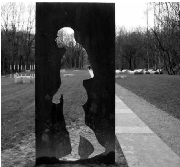
Fig. 9 – Neanderthal men “lives” in many shapes in the park of the Neanderthal German Museum.