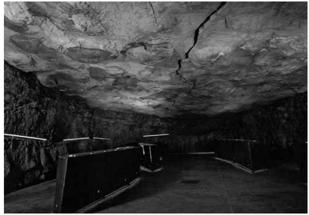
Fig. 4 – Museo de Altamira: the replica of the Cueva de Altamira and the interactive-multimedia base allow the visitors to be active in their exploration and to hold a greater quantity of information concerning the boarded theme.