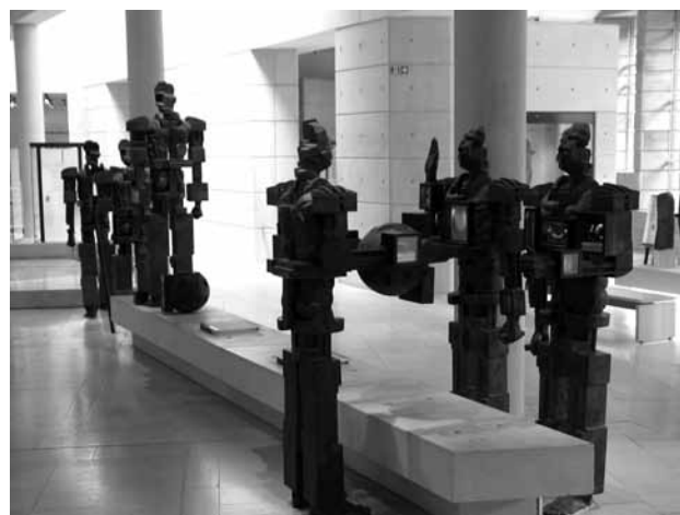
Fig. 10 – The “Early people” exhibition, by Edward Paolozzi (1924-2005), Museum of Scotland, Edinburgh.