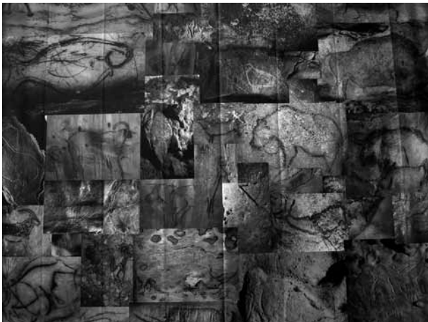
Fig. 5 – Parc Pyreneen de l'Art Préhistorique, the "Salon Noir": the big wide screen reproduces lots of the works that prehistorical men have painted or carved on the rock faces of the caves of the entire world.