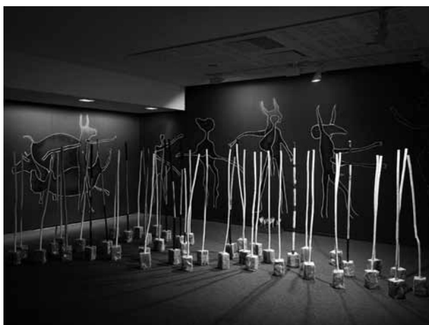
Fig. 11 – Serge PEY, “Tombeau pour Sawtche alias Saartje Baartman Venus Hottentote”, temporary exhibition, 2009.