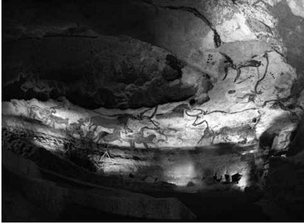
Fig. 1 – Lascaux II: a replica of two of the cave halls with Paleolithic paintings (1983), opened near the original cave in Montignac (Dordogne).