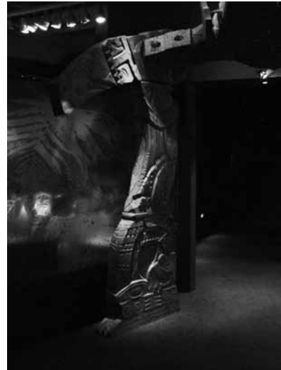
Fig. 6 – National Museum of New Zealand, Te Papa Tongarewa: the architecture of interior becomes decorum.