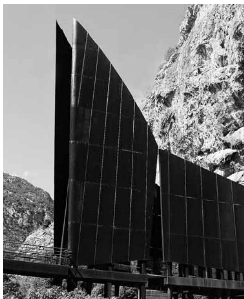
Fig. 7 – The entrance of the Niaux Cave, with a great “Mammoth” designed by M. Fuksas (1993).