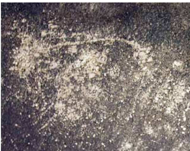
Figure 5: zenithal picture of a geoglyph, representing a trunked animal