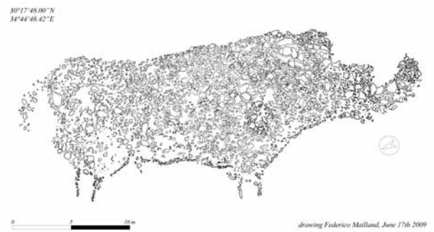
Figure 4: drawing from zenithal picture of a rhinoceros-shaped geoglyph