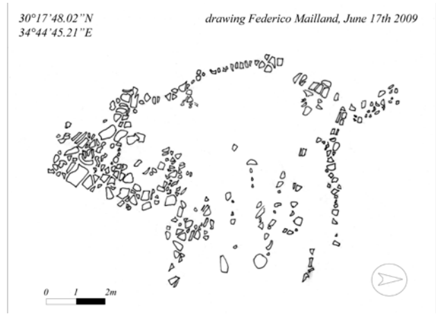
Figure 8: drawing from the zenithal picture of a quadruped-shaped geoglyph