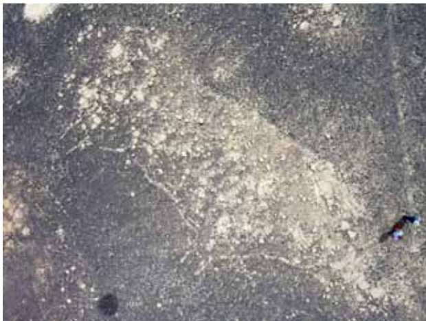
Figure 3: zenithal picture of a rhinoceros-shaped geoglyph