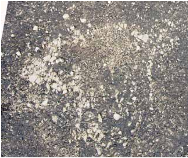
Figure 7: zenithal picture of a quadruped-shaped geoglyph