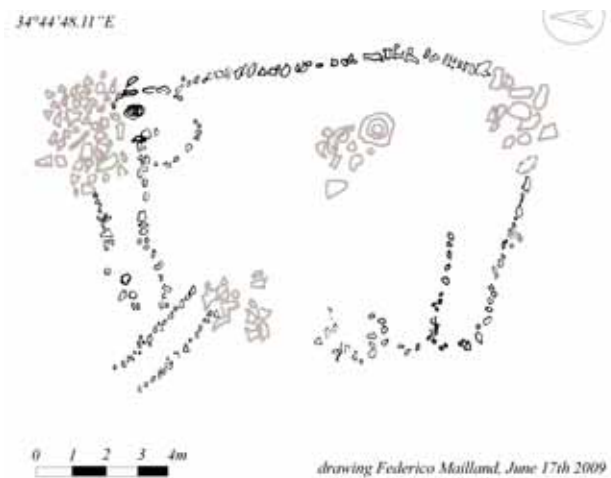
Figure 6: drawing from the zenithal picture of a geoglyph, representing a trunked animal. The tumuli, posterior to the geoglyph, are drawn in gray