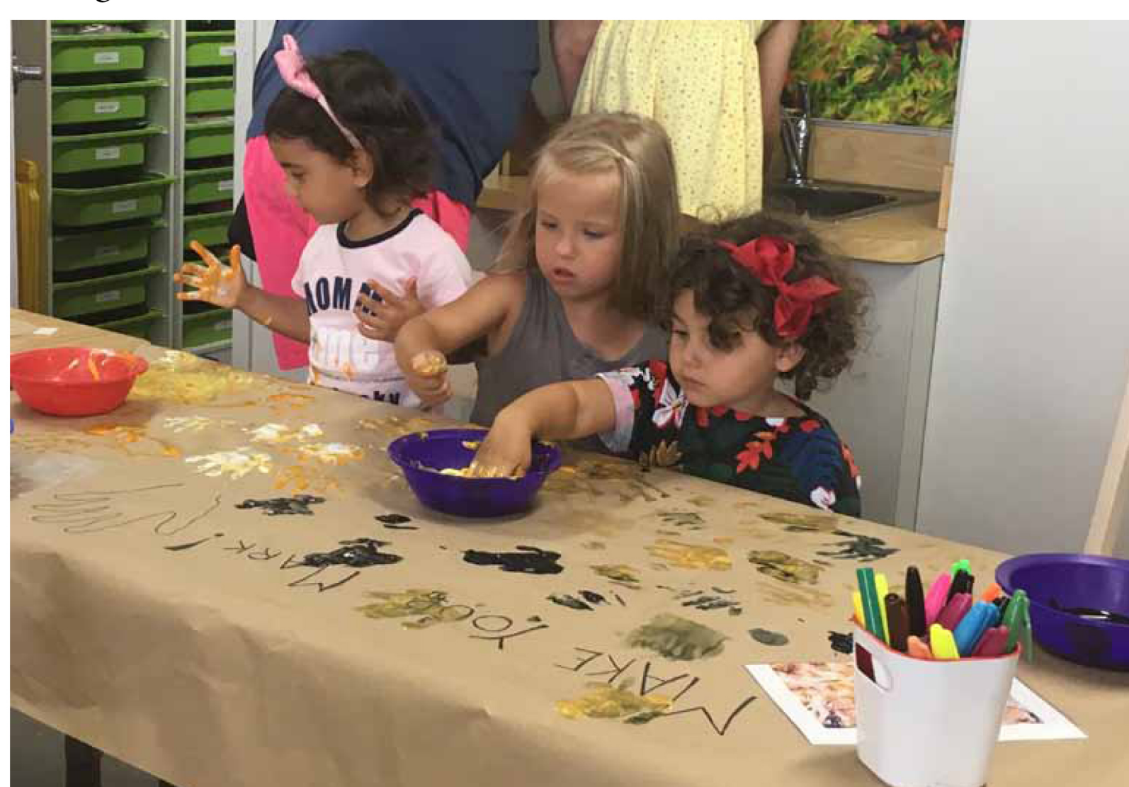
Hands - positive

FROTTAGE, ENGRAVING AND TRACING LIKE AN ARCHAEOLOGIST: accompanied by images of original rock art and tracing from Valcamonica - Italy, children experimented the frottage technique, carving and tracing like an archaeologist on plaster castings. Materials: plaster castings from real rock art, tracing paper, carbon paper, charcoal, sticks, aluminium foil. By frottage and by tracing children could feel and understand the hammering technique on the rock. In addition they practiced manual and technical work.