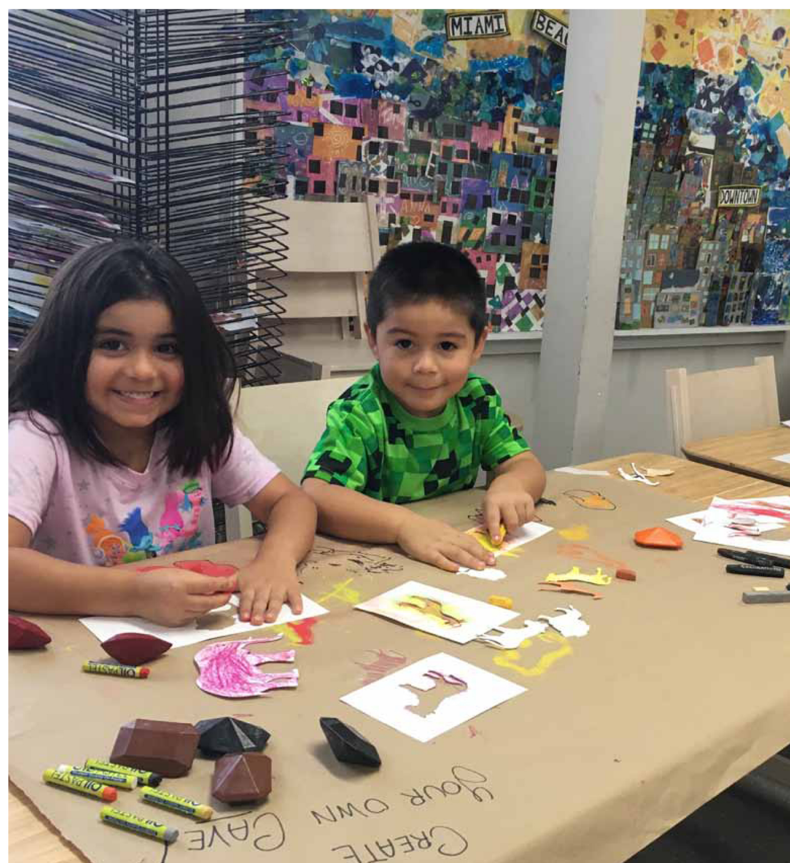
Create your own cave