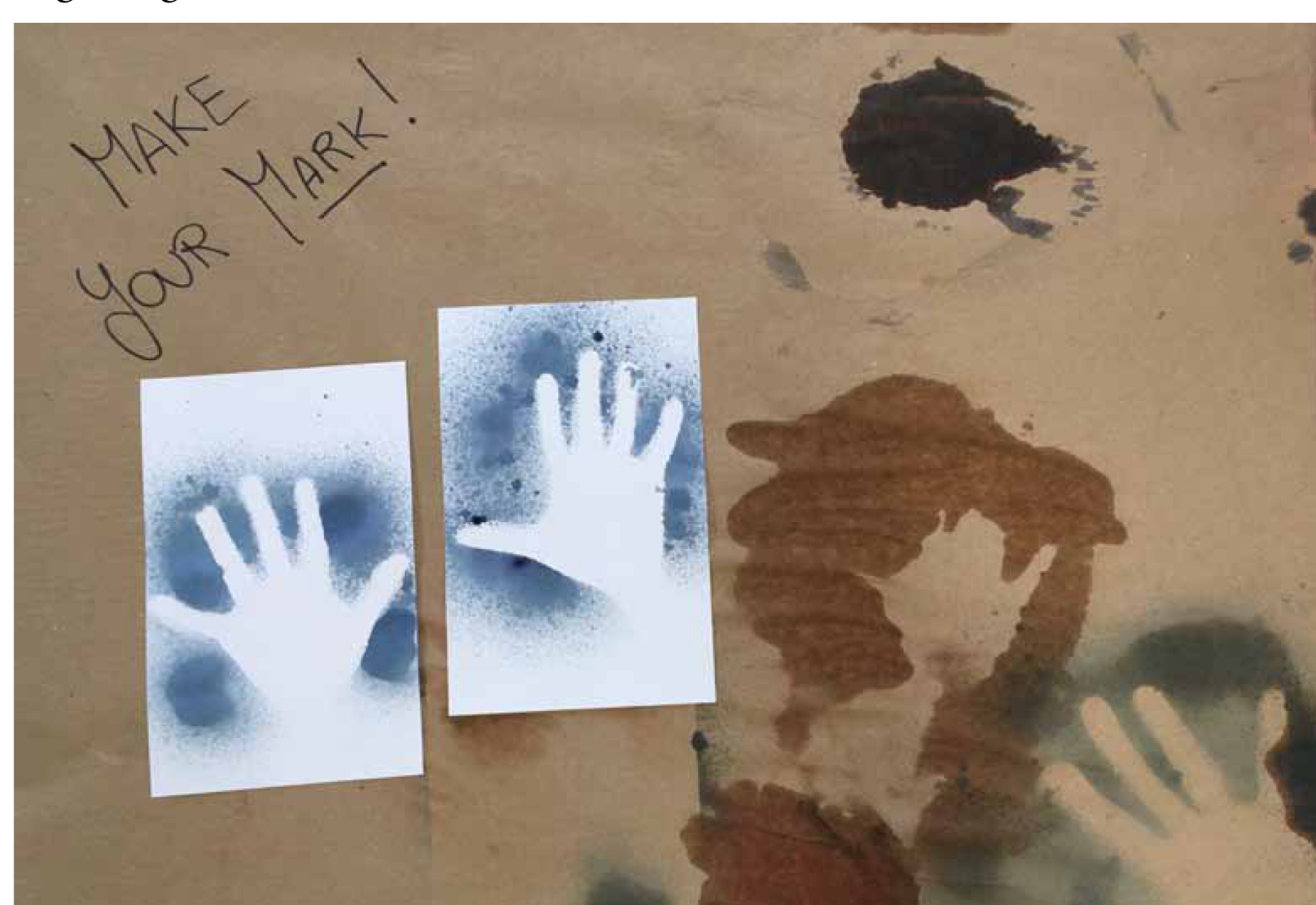
Hands - negative

The final result is impressive and it is good for all ages.