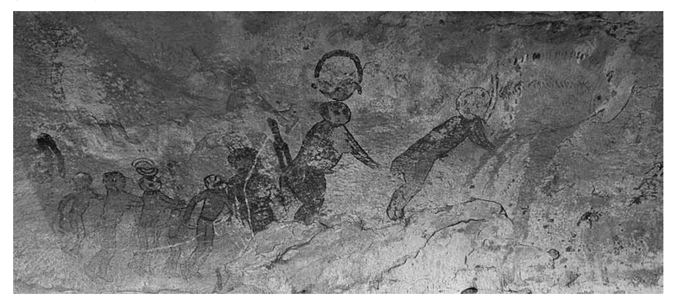
Figure 3 – Tassili N'Ajjer - Jabbaren.