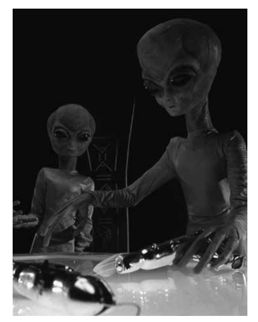
Figure 4 – Aliens from movie "Intruders" (1992) Directed by Dan Curtis