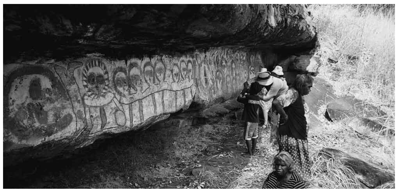
Figure 2 - Wandjina figures represent cloud spirits and form part of a continuing cultural tradition dating back almost 4,000 years. (Donalson, 2000)